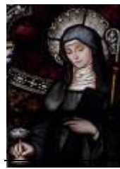
Ste. Brigid, patron saint of scholars

Our club has been awarding college scholarships to Long Beach students practically since our inception. We began awarding scholarships to LBCC students in 1928. Last year we added Jordan students to our list of recipients, which now include Poly, St. Anthony, Wilson, and LBCC. The scholarships are awarded to two students from each school and are one-time awards of $1000 each, payable next year upon verification of college enrollment. As announced last year, we will no longer be awarding achievement awards to middle school students.